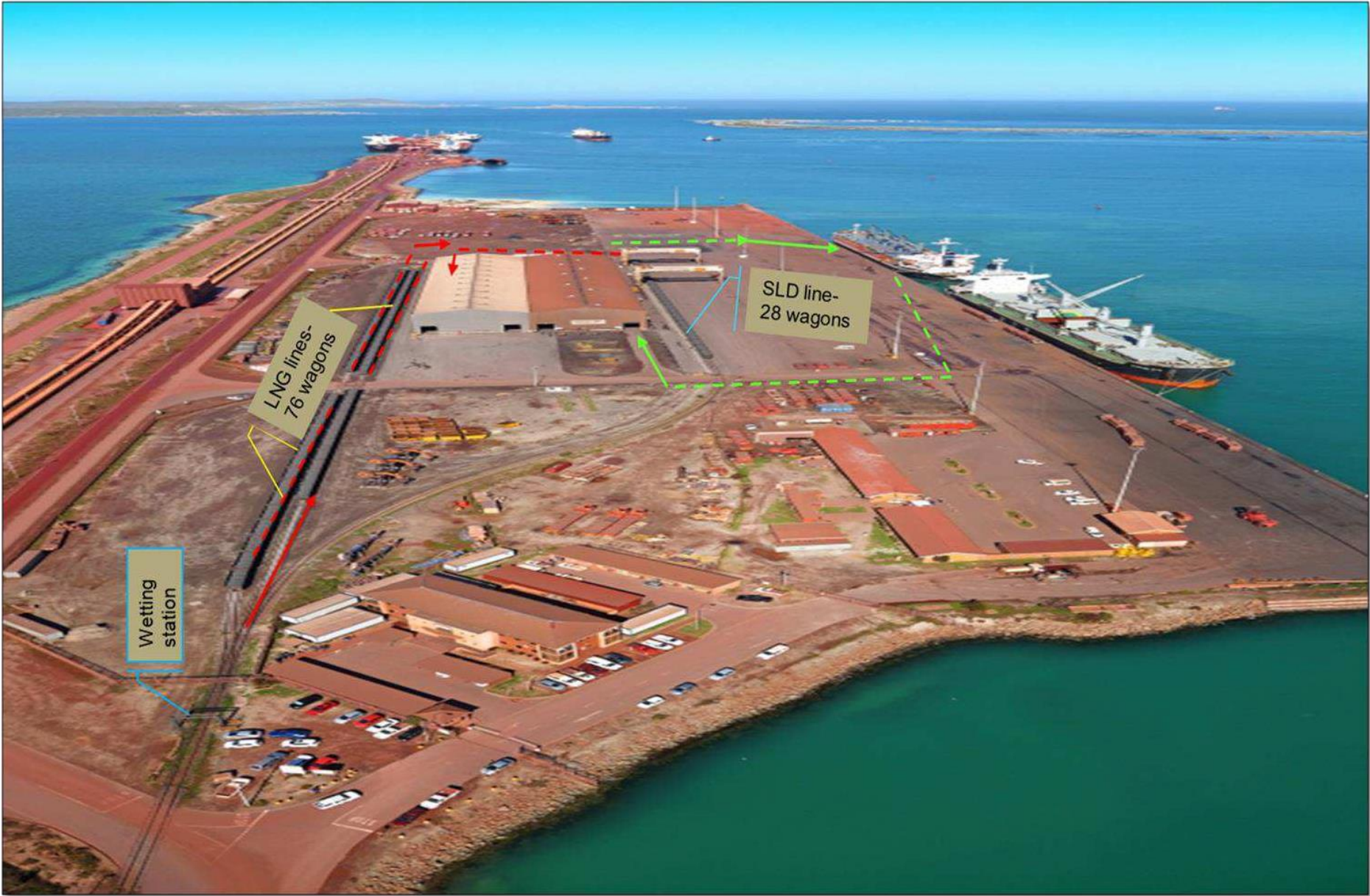
Terminal View – Manganese Facility Layout