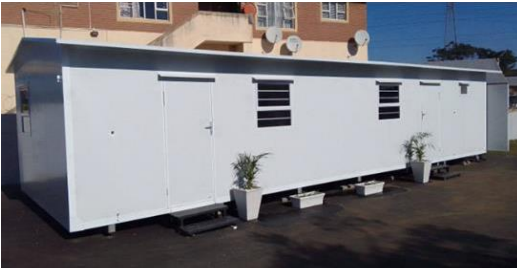
Figure 1: Example of the required prefabricated facility

example of the required prefabricated facility.