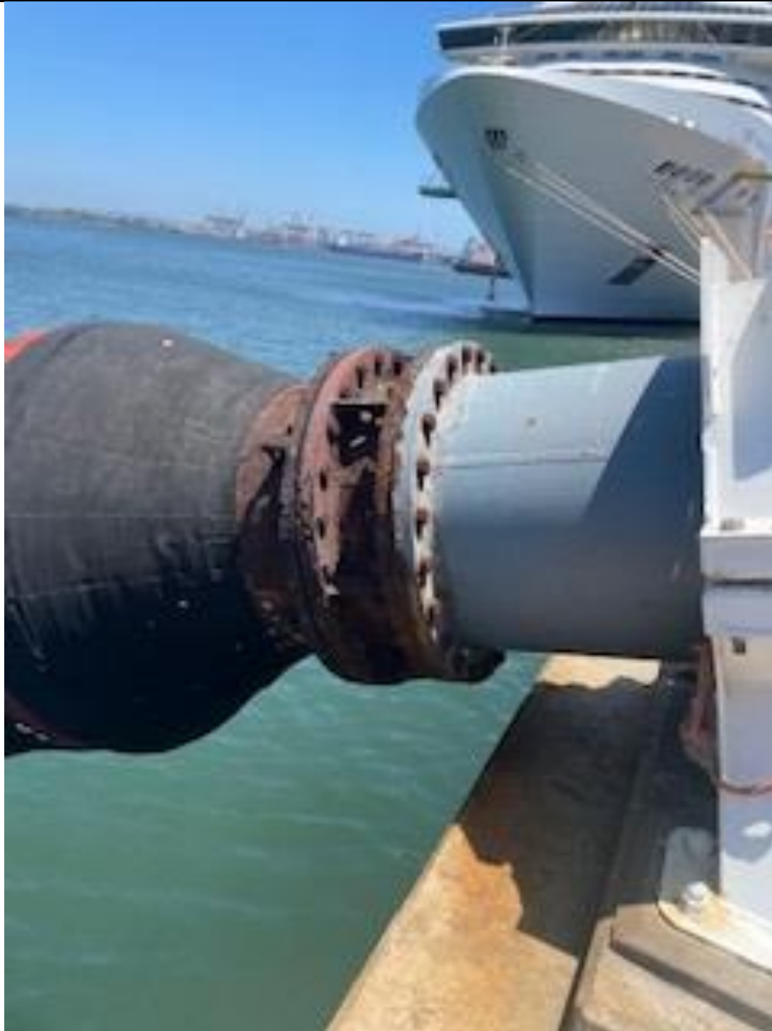
Rusted Flanges: Require replacement of nuts and bolts plus denso tape.