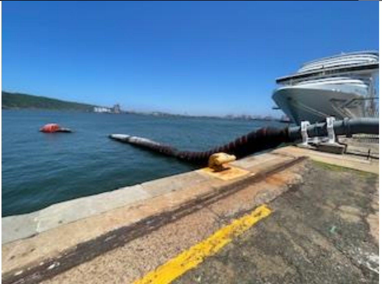
Entire HDPE Pipe section to refurbished and regreased effectively.