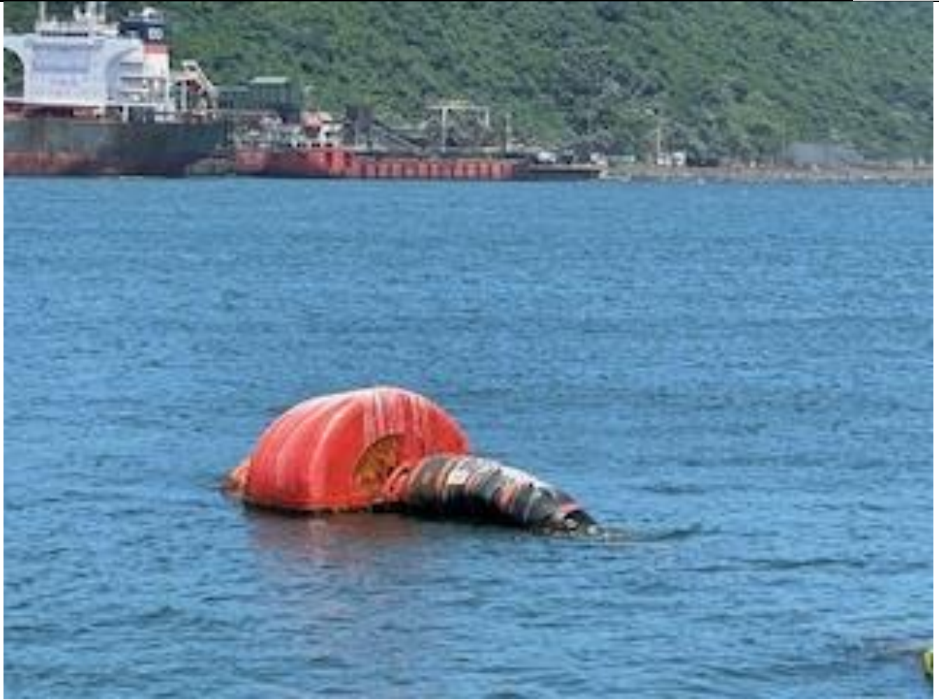
Leaking Coupling tomato-head. Require leak fixing, barnacle pressure cleaning and re-greasing.