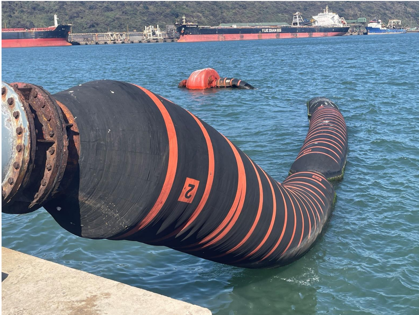
Entire HDPE Pipe section to refurbished and regreased effectively.