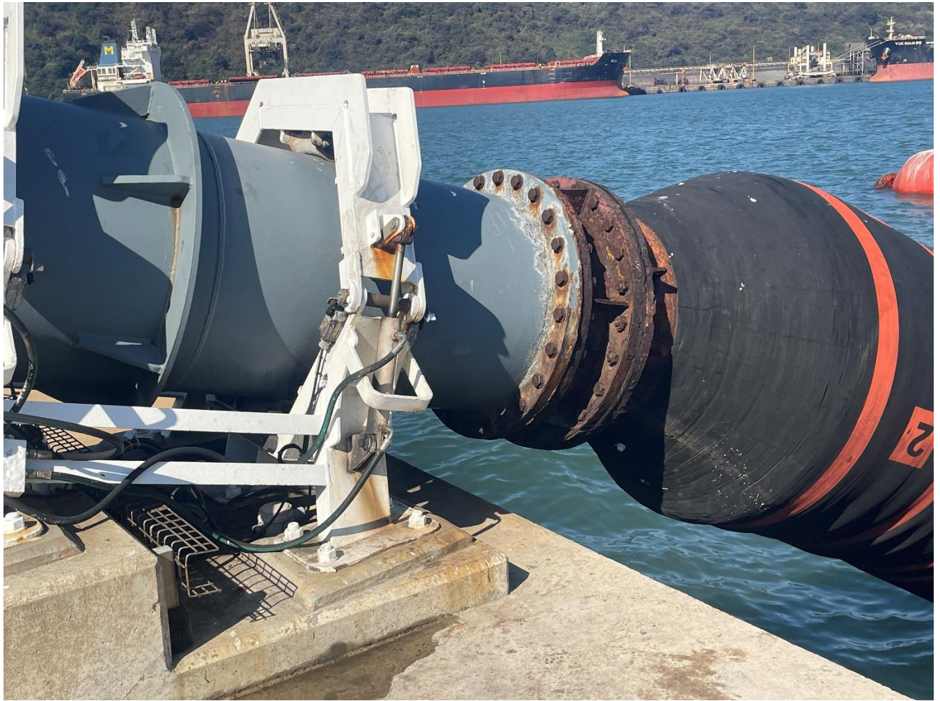
Steel connection point require denso tape and replacement of rusted pins, bolts and nuts.