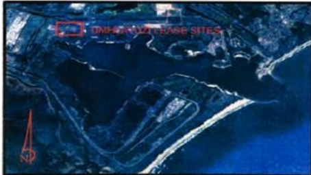
LOCALITY PLAN - NTS