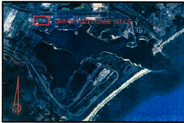
LOCALITY PLAN - NTS