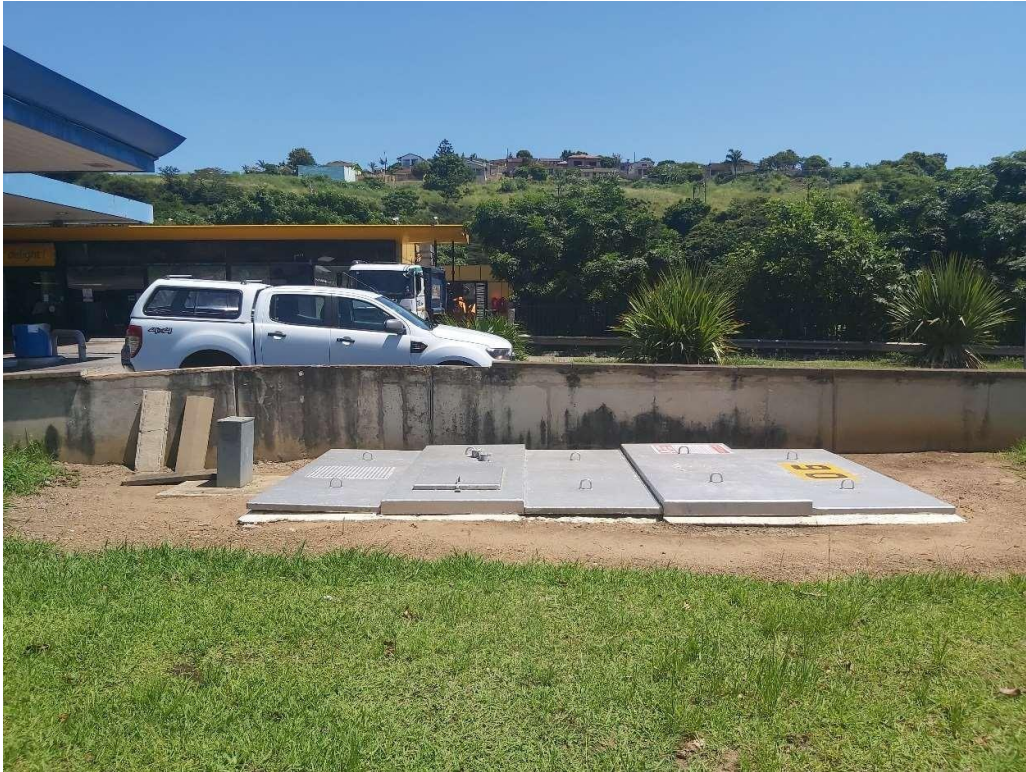
Figure 1: Sasol Filling Station, Demarcation Wall & TPL Block Valve Chamber