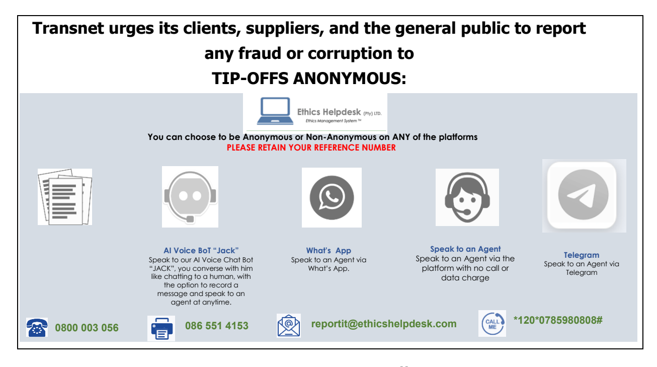
Figure 1: Anonymous Tip-offs