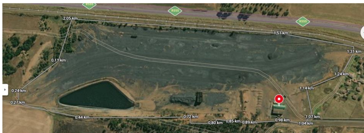
Figure 1: Kendal Siding (-26.05708,28.94782)

Kendal siding consists of 4 lines, and the siding can only be accessed from the Ogies side. Lines are numbered as 1-4 terminating at stop block on the Welgedag side. Line 1 and 2 is alternatively used to load coal for local destinations. Line 3 (60 wagons) and 4 (70 wagons) are longer and used for loading both export and domestic. Rail weighbridge is installed at the entrance of the siding on the Ogies side. All lines are NON-ELECTRIFIED and movement to and from siding is controlled by CTC Ogies. Export/RBCT empties are brought as 100 wagons and get split inside the siding, while domestic coal empties approximately around 50 wagons is placed at once. (No split on line 3 and 4). The below image is the plan photographic view of Kendal siding: