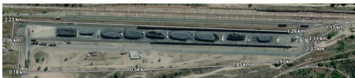
Figure 1: Pendoring Siding (-25.6347410, 27.8110760)

Transnet Port Terminals manages the offloading of Chrome Ore from the tipper trucks coming from the mines onto the stockpiles, which it also manages operations on a day-to-day basis. Chrome is supplied by private Road Motor Transport (RMTs), stockpiled according to client’s specifications and grade. Transnet Freight Rails supplies rail wagons which are then used to load chrome and dispatched by rail and destined for the Port of Richards Bay. The below image is the plan photographic view of Pendoring siding: