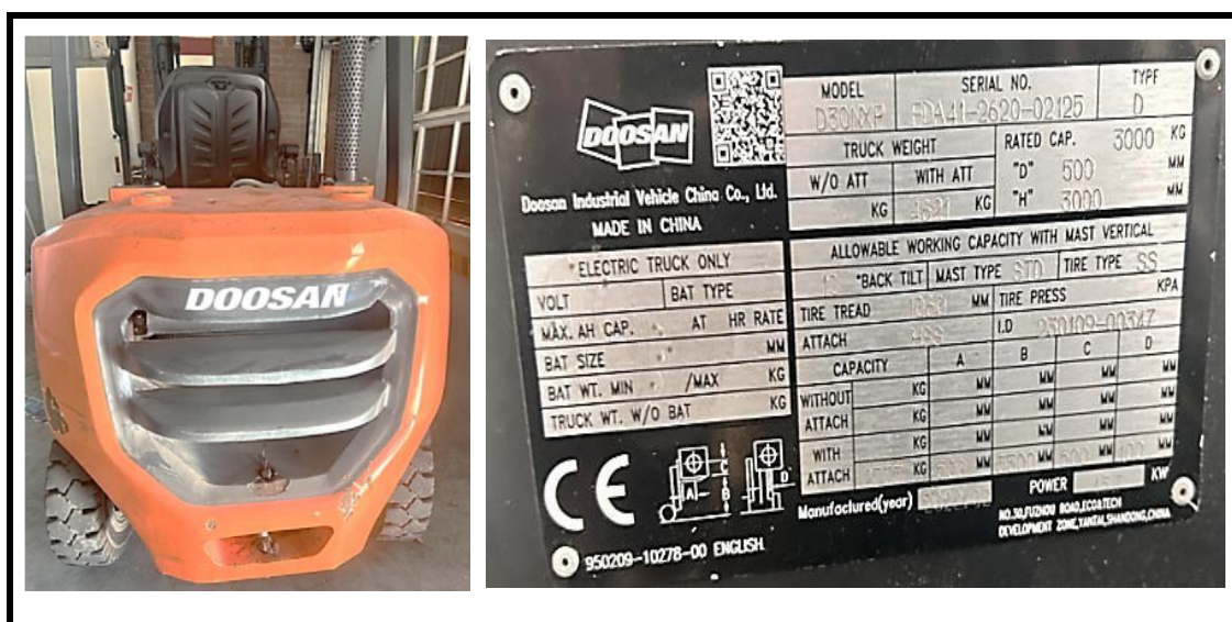
Figure 1: The actual forklift truck at the Port of Mossel Bay

The Port of Mossel Bay procured a new 3-ton forklift truck (DOOSAN D30NXP) in 2022 to sustain the relevant operational activities across the port. The truck replaced an older truck that had been in service for decades, and its useful life had been exceeded. The new truck is deployed in the ship repair facility, and in addition, it serves other internal functions across the port. The forklift is due for its first maintenance service, and the Employer aims to enter into a five (5) year contract for the maintenance of the forklift. Figure 1 below shows the equipment information.